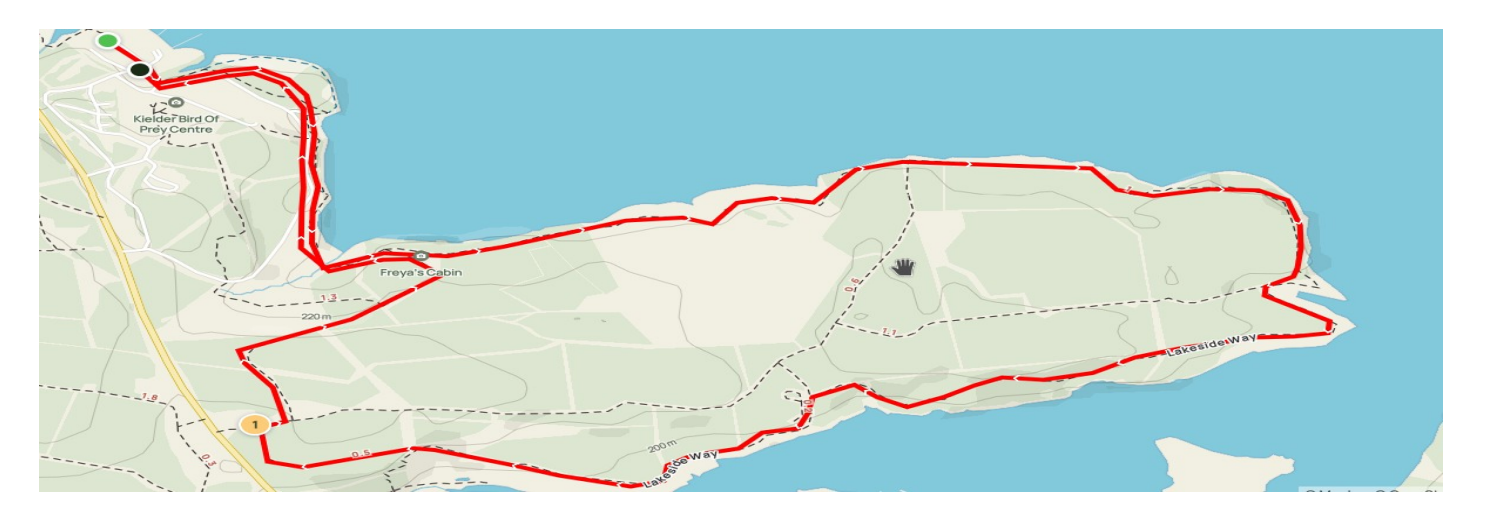
FULL ROUTE DETAILS AND PROFILES CAN BE FOUND ON WEBSITE.